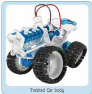
Twisted Car body